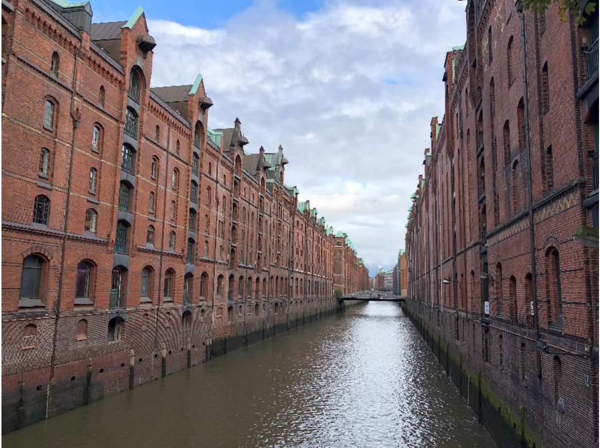
Figure 8 & 9. Cultural Buildings in the Speicherstadt neighbourhood, Hamburg