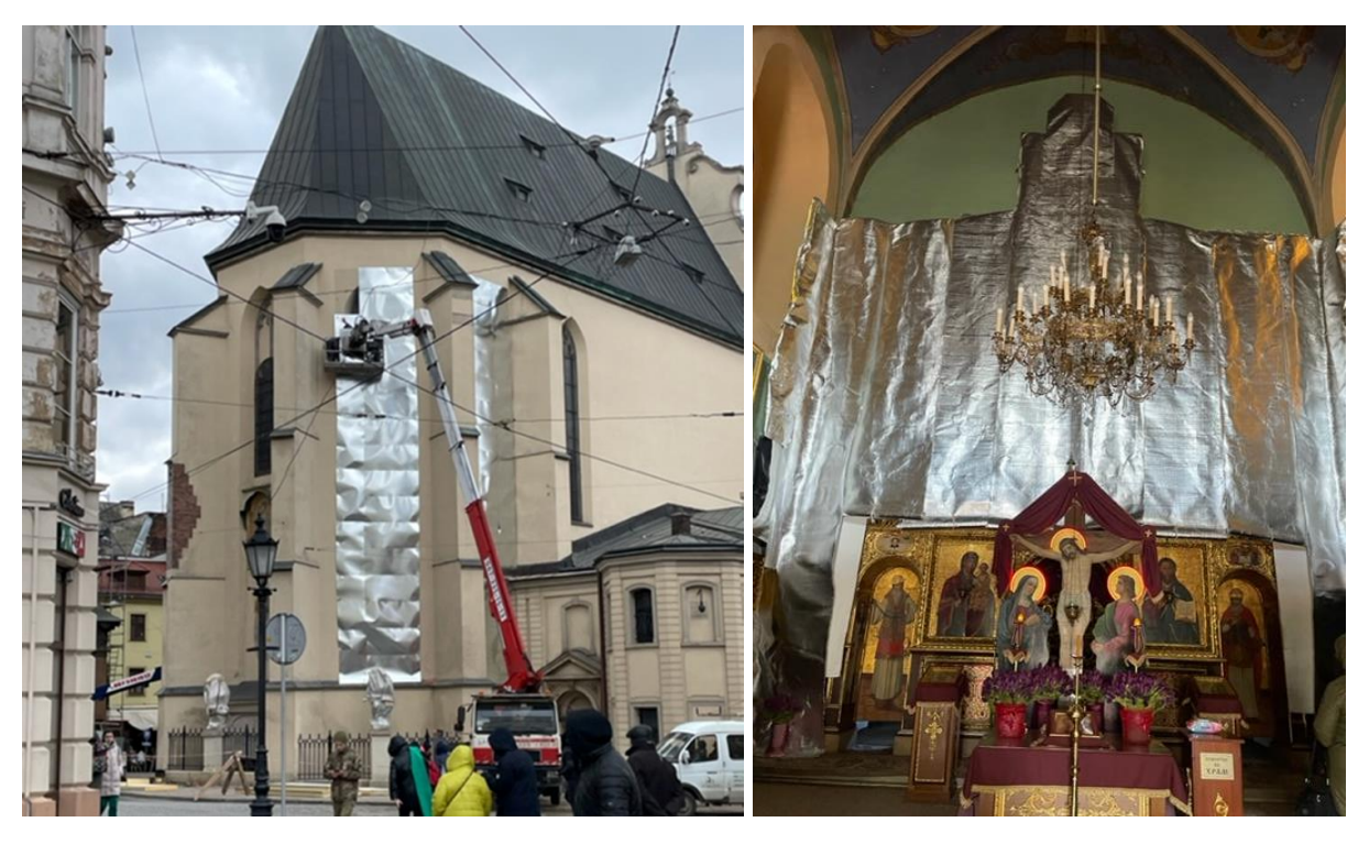
Figure 4. The renaissance Kampian and Boim chapel (left) and Paraskeva-Piatnytsia church (right)