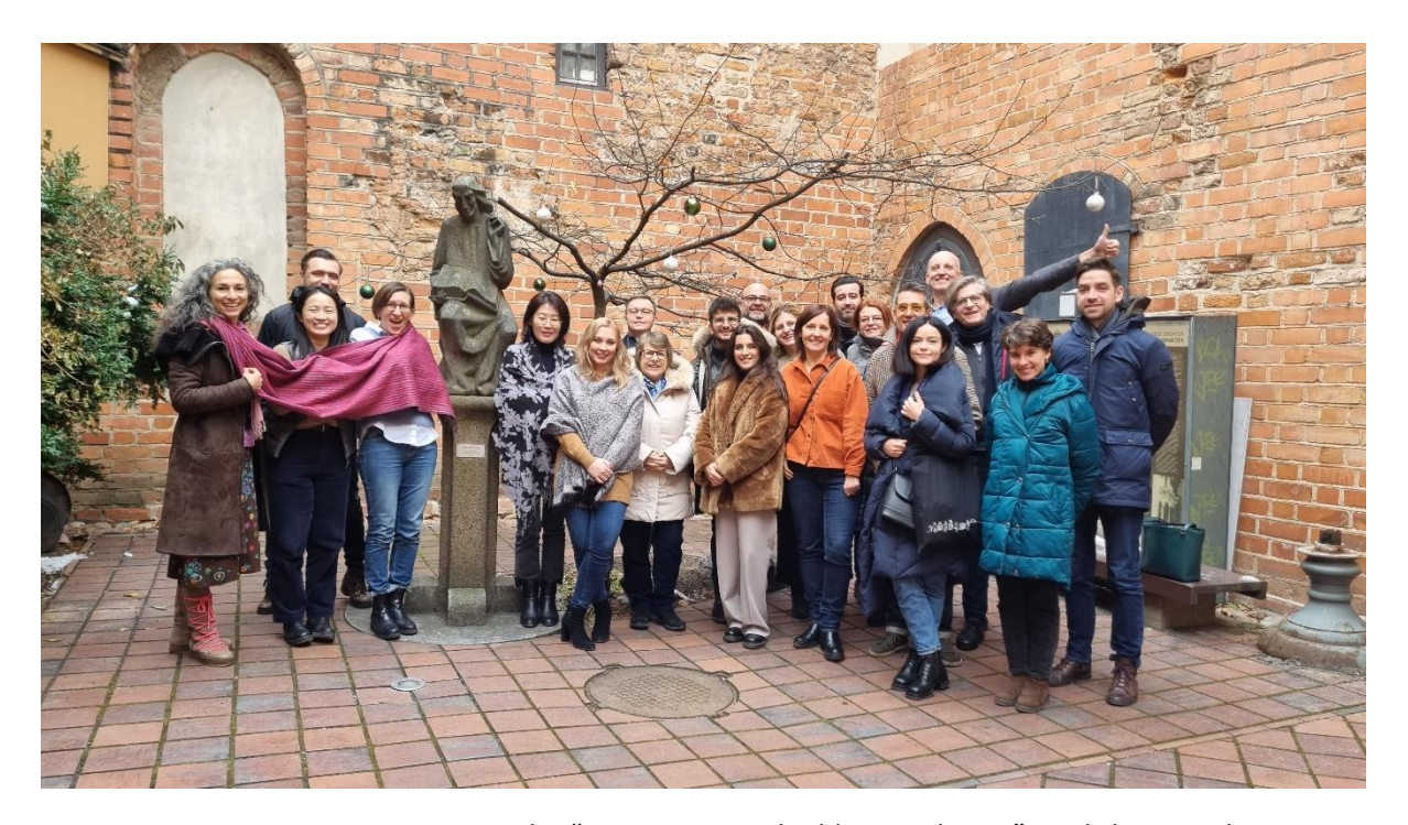
Figure XX. Participants at the "Heritage cities building resilience" workshop in Vilnius

members of the OWHC network to support them build resilience for their cultural heritage sites. In the long term the OWHC community of practice aims to further continue the collaboration with the member cities to develop a comprehensive roadmap for managing disasters in the cultural heritage cities that can be adopted widely and gain political support.