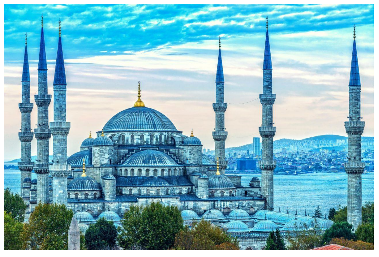
Figure 5 and 6 Hagia Sofia & Blue Mosque, Istanbul