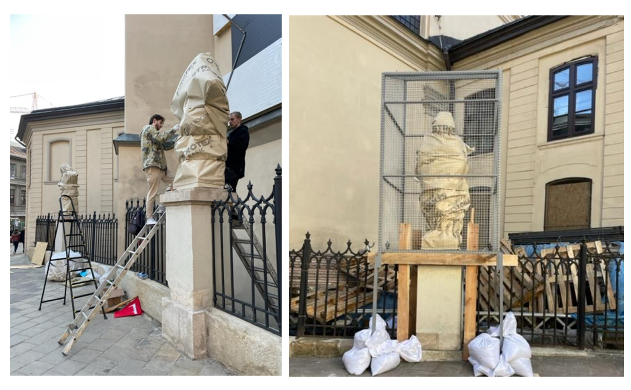
Figure 3. Preventive action to protect the cultural monuments in the city of Lviv, Ukraine