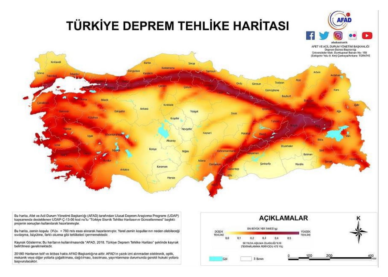
Figure 7. Turkiye Earthquake hazard map