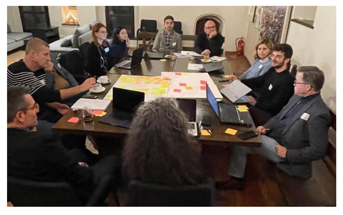
Figure 1. Co-creation activities during the "Heritage cities building resilience" workshop

The primary objectives of the Organization are to facilitate the implementation of the World Heritage Convention, to encourage cooperation and the exchange of information and expertise on matters of conservation and management, as well as to develop a sense of solidarity among its member cities. To this end, the OWHC organizes World Congresses, conferences, seminars and workshops dealing with the challenges faced in the area of management and it provides strategies for the preservation and development of historic cities. Six Regional Secretariats support the work of the OWHC General Secretariat which is based in Québec/Canada.