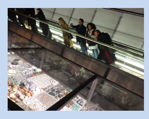
Regional Conference Amsterdam 2018