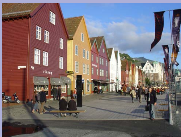
City of Bergen - Bryggen