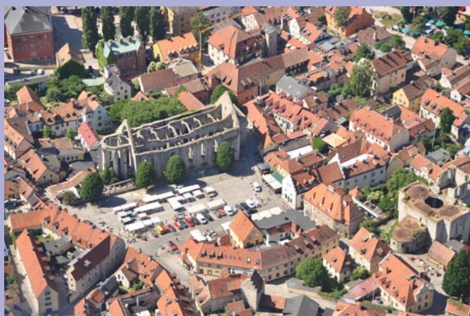
City of Visby