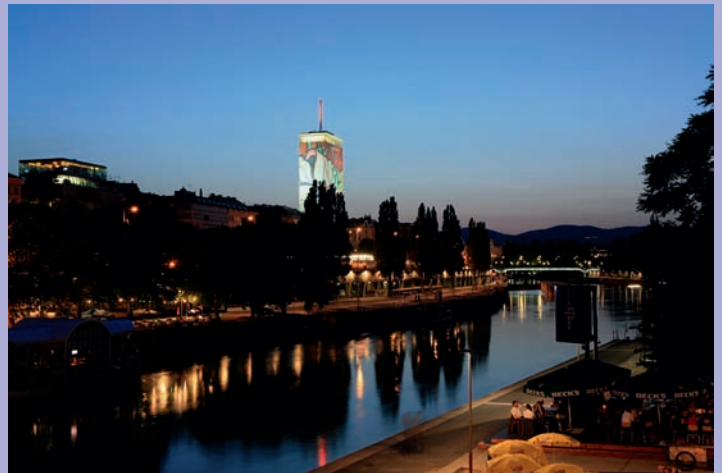
City of Vienna - Ringturm

petitions for referendums and in some countries referendums themselves. And if these measures prove impossible, mass demonstrations against the urban planning proposals occur. Dealing with citizens' initiatives becomes increasingly difficult when the organized protesters do not represent the public as a whole. It is quite often the case that they represent a conservative subgroup which is averse to contemporary architecture. Protests can be difficult to manage because they often lack credible spokespersons. Their sudden rise translates quite often to protesters not having all the facts, and the speed of protests is increased by the fast exchange of information through social media. Conserving a historic legacy does, however, place a high value on expertise and an awareness of the numerous criteria that go beyond a mere aesthetic evaluation. Even so, the public is basically aware of the concept of World Heritage and regards it positively. As such, the fundamental concept of World Heritage Cities must continually be communicated to the public, and as early as possible. It must be done with as much transparency as possible especially with regard to the processes involved. By doing so, understanding and appreciation can be created for the actions that must later be carried out.