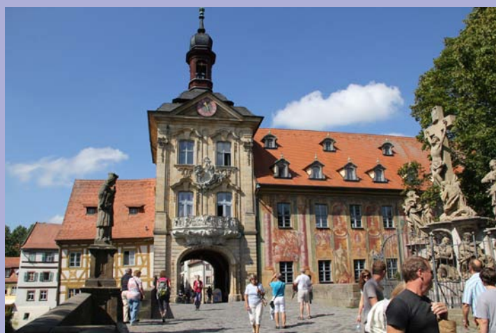
City of Bamberg - Old Town Hall