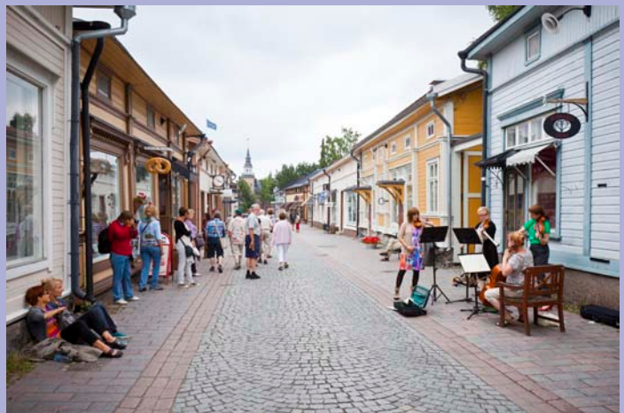
City of Rauma