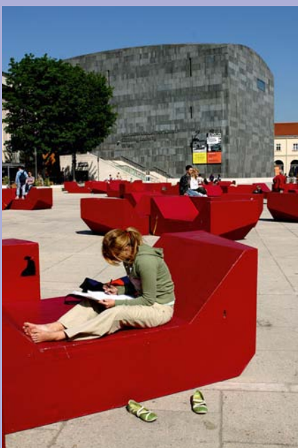
City of Vienna - Museumsquartier