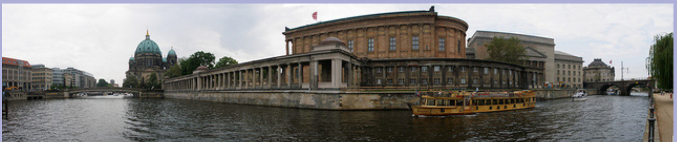
City of Berlin - Museumsinsel Panorama