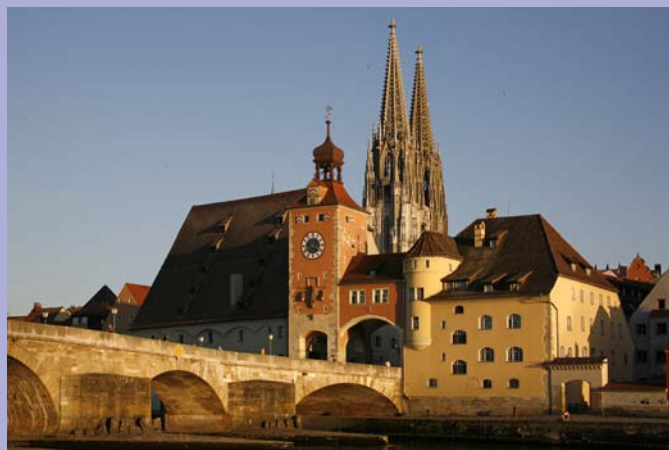
City of Regensburg