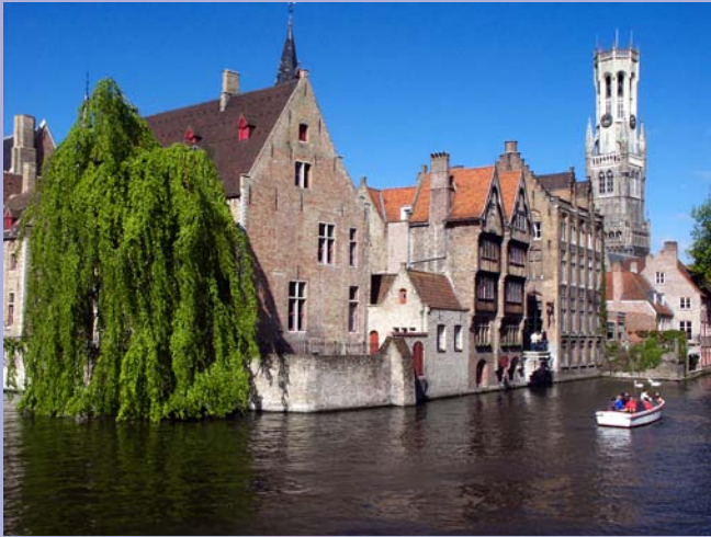
City of Brugge - Canal Rozenhoedkaai