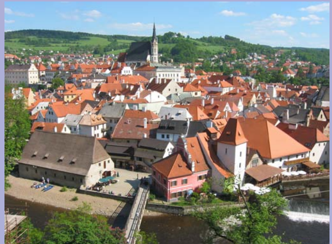
City of Český Krumlov - View from the Castle