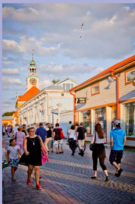
City of Rauma