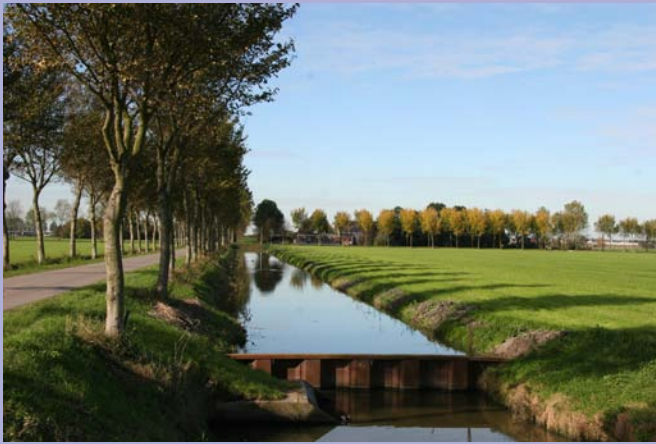
City of Beemster