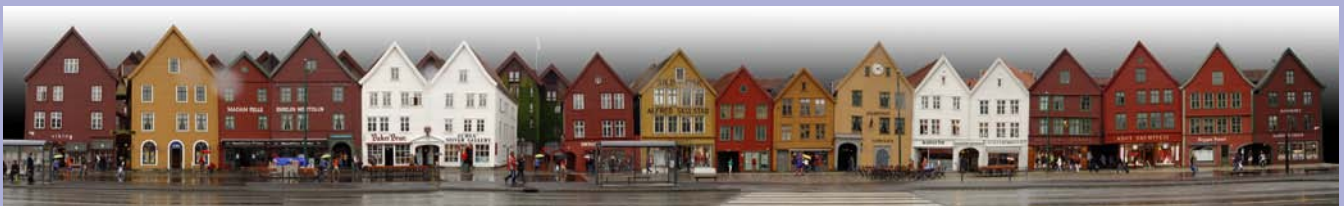
City of Bergen - Old Brygge Buildings