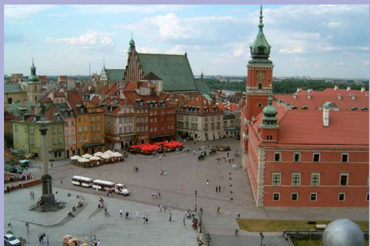
City of Warsaw - Royal Castle Square