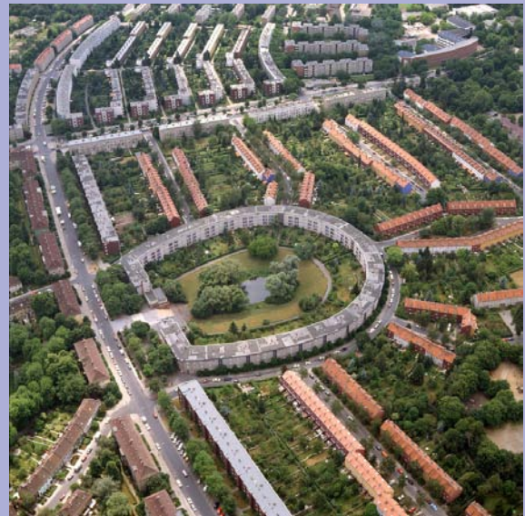
City of Berlin - Aerial view of the Modernist Housing Estates

State.” Article 5 stipulates that each State Party to this Convention shall endeavour, in so far as possible, and as appropriate for each country, to adopt a general policy which aims to give the cultural and natural heritage a function in the life of the community and to integrate the protection of that heritage into comprehensive planning programmes. Over and above that, appropriate legal, scientific, technical, administrative and financial measures necessary for the identification, protection, conservation, presentation and rehabilitation of this heritage are to be taken. It is left to each State Party of this Convention to decide what administrative and legal arrangements are made for the protection of the World Heritage.