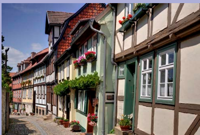
City of Quedlinburg - Schloßberggasse