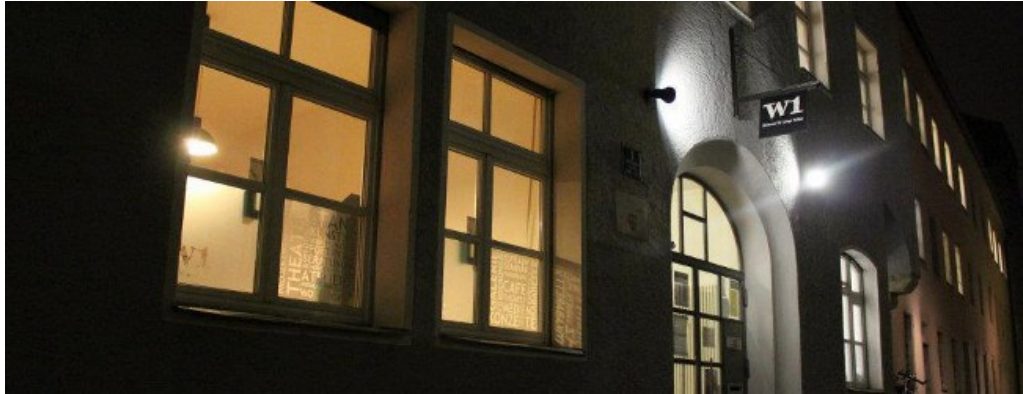
Venue: W1—Centre for young culture, located close to the Haidplatz

W1 - Centre for young culture Weingasse 1 93047 Regensburg Germany