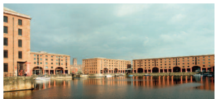
Albert Dock, Liverpool

Liverpool is partner in the HerO network and EAHTR member city