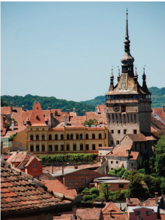
The Citadel of Sighișoara, Romania

Published: January 2010 by the City of Regensburg, Planning and Building Division, World Heritage Management, Neues Rathaus, D.-Martin-Luther-Str. 1, 93047 Regensburg, GERMANY, Phone: +49 (0) 941/507-1768, Fax: +49 (0) 941/507-4619, E-mail: hero@regensburg.de Printed copies: 750; Print: Erhardi Druck, Regensburg (GERMANY)