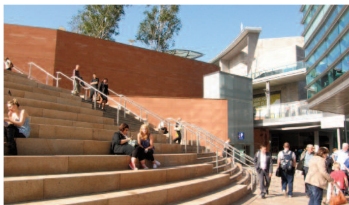
Liverpool ONE, a shopping, residential and leisure centre in Liverpool city centre, opened in 2008

We therefore call on the European commission to promote integrated urban development approaches as a central requirement of all EU and national policy for urban areas.