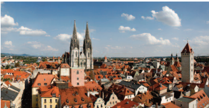
The Old Town of Regensburg, Germany

The HerO partner cities are Regensburg (Germany, Lead Partner), Graz (Austria), Naples (Italy), Vilnius (Lithuania), Sighișoara (Romania), Liverpool (United Kingdom), Lublin (Poland), Poitiers (France) and Valletta (Malta).